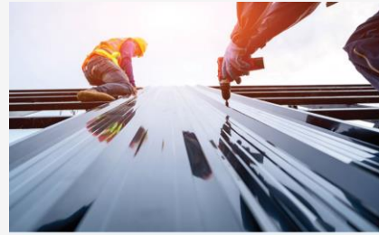
Whether you've been in the roofing business or are just getting started, every roofer will need these tools handy to make the most of the next decade.

Paired with the fact that multiple states saw sharp increases in COVID-19 cases, including a record single-day spike of 60,000 new cases in the U.S. on Tuesday, roofing contractors find themselves stuck between a rock and a hard place for keeping their crews safe.