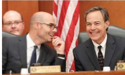
Rep. Dennis Bonnen, left, and outgoing Speaker Joe Straus

Bonnen, who has served in the Texas House since he was 24 years old, amassed 109 pledges of support for speaker last month, from Republicans as well as 31 Democrats. Members will officially vote on the speakership in January when the Legislature convenes in Austin.